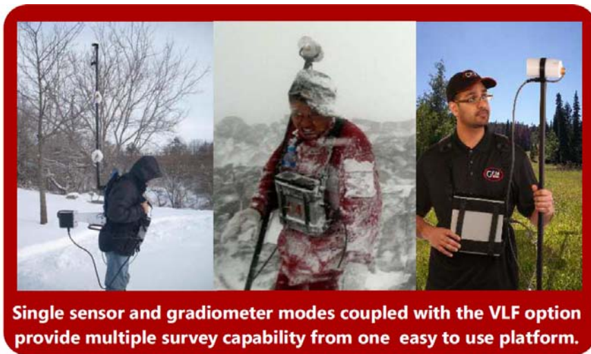
Single sensor and gradiometer modes coupled with the VLF option provide multiple survey capability from one easy to use platform.