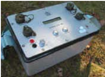
Extension Switch Pro box able to drive 24 - 48 - 72 or 96 electrodes

Extension Switch Pro box(es), with specific cables, can be connected to the ELREC Pro unit for an automatic switching of the reception electrodes according to preset sequence of measurements ; these sequences have to be created and uploaded to the unit from the ELECTRE II software.